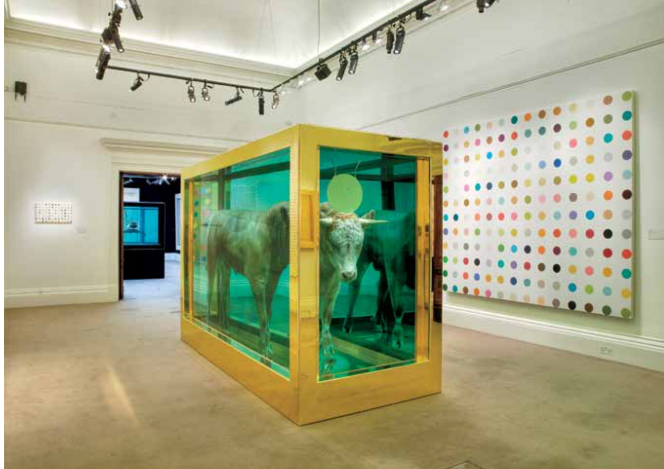
Damien Hirst's Golden Calf , 2008, topped with an 18-karat-gold headdress, at the "Beautiful Inside My Head Forever" sale at Sotheby's London in September 2008.